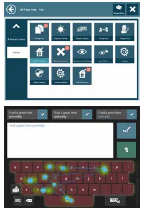
The "Quick Menu" gives caregivers access to the most commonly used settings and functions in Communicator 5. On the bottom right you can see the new "dwell-free" keyboard in action.